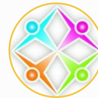
GENERATIONS WORKING TOGETHER